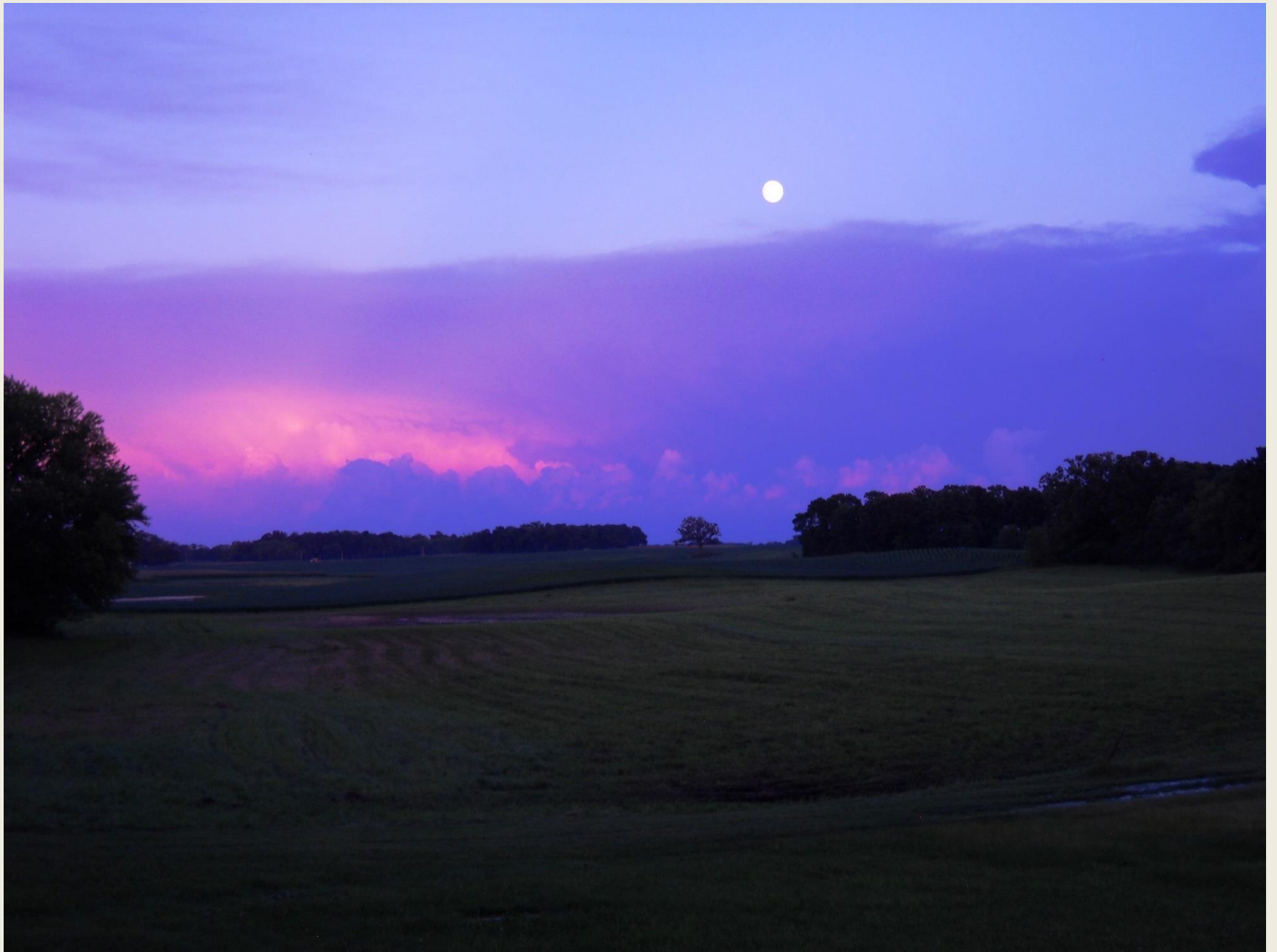
Moonrise, summer 2016.