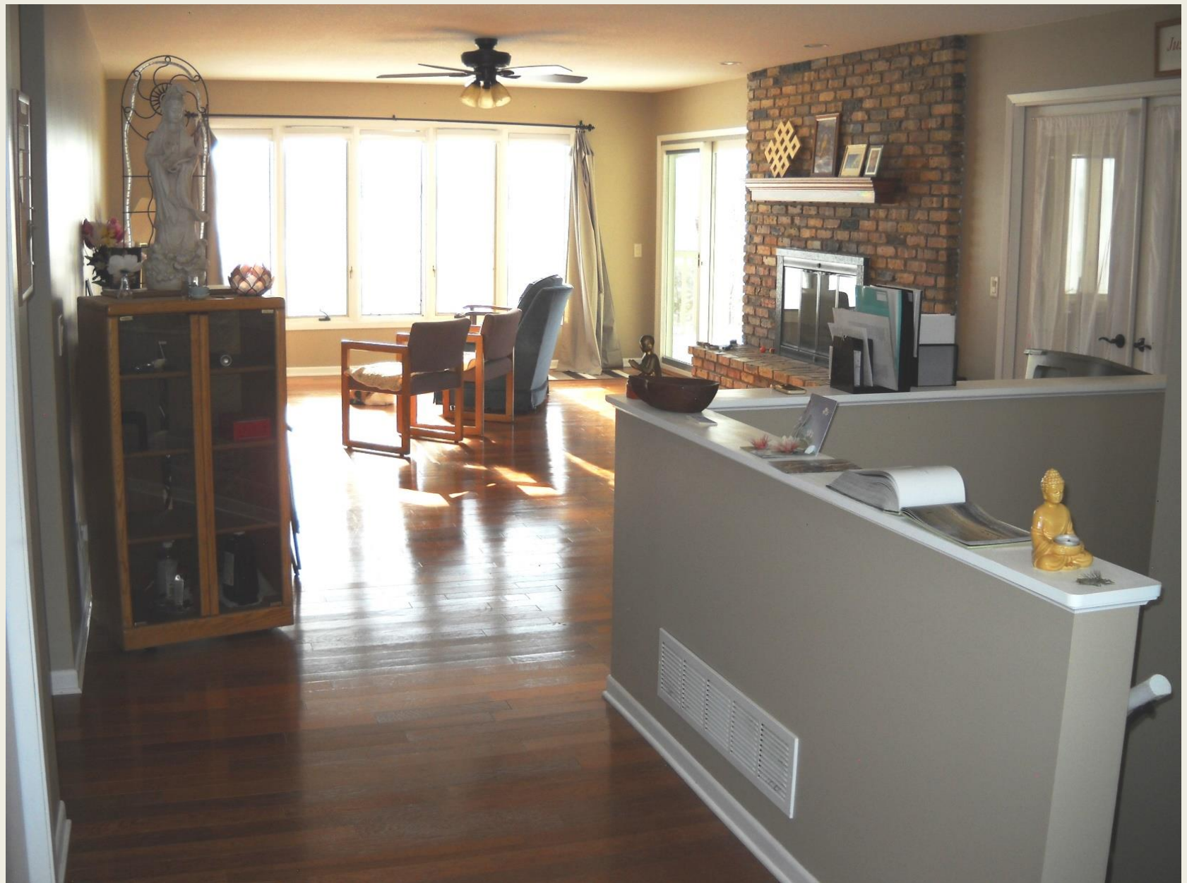
Looking into common room from the entryway. Meditation hall is through the double doors on the right.