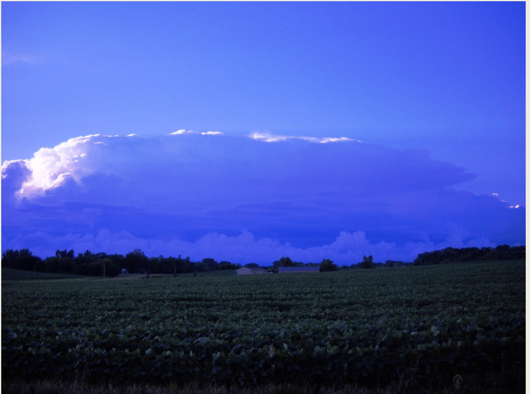
Storm brewing to the northwest.