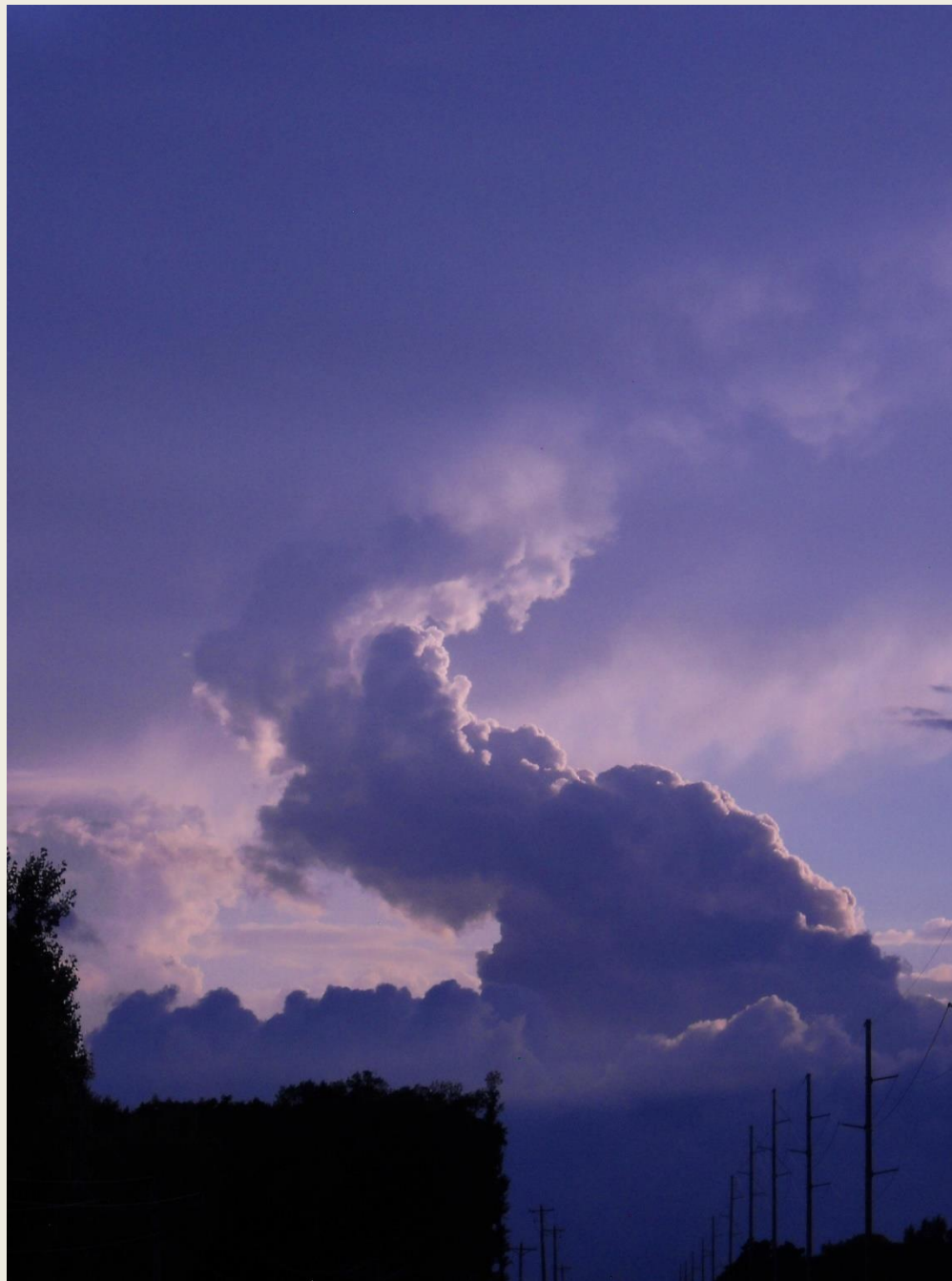
Looking west down the gravel road in front of the temple.