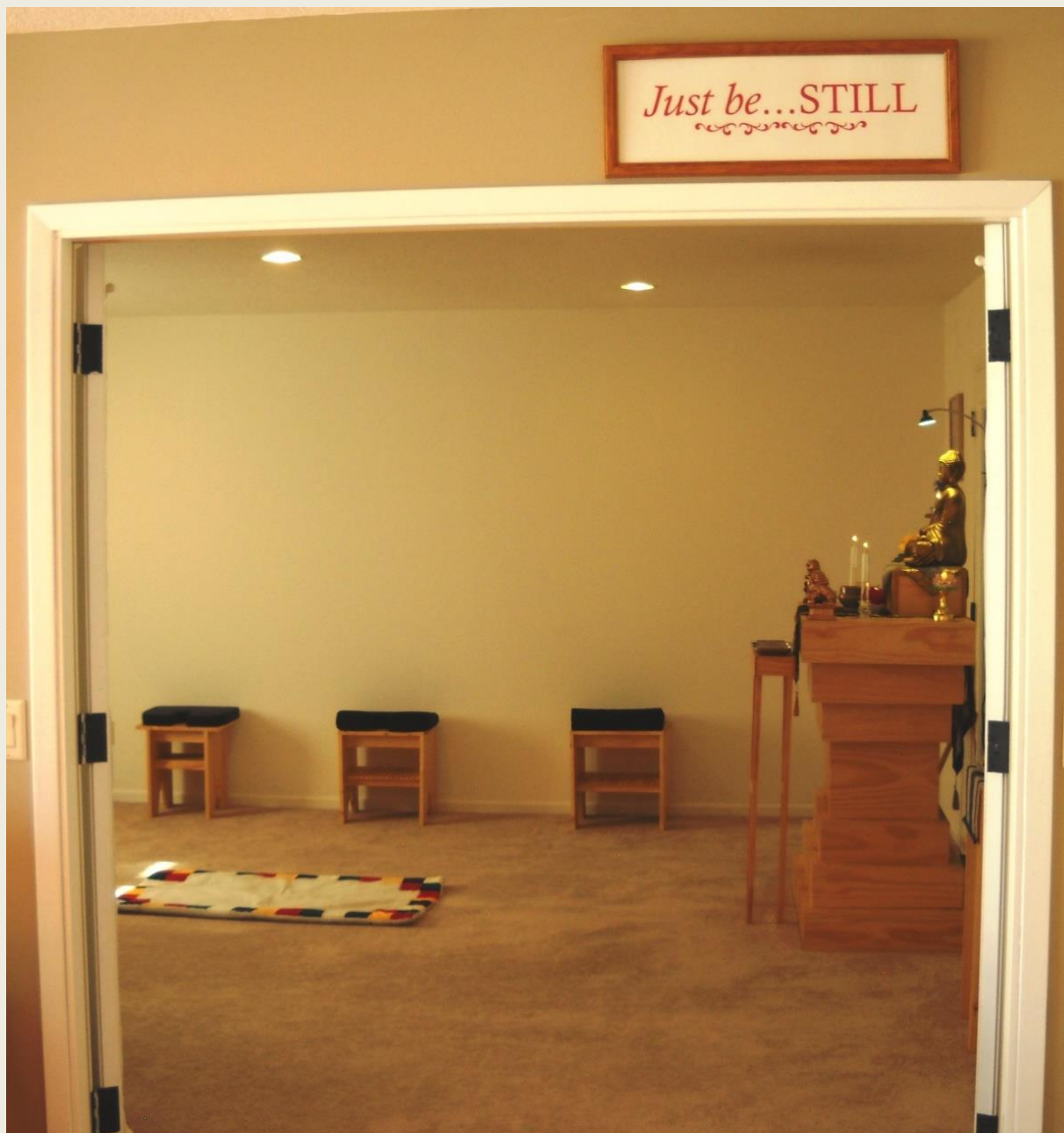
Looking into the meditation hall. (My sister kindly made the haiseiki.)