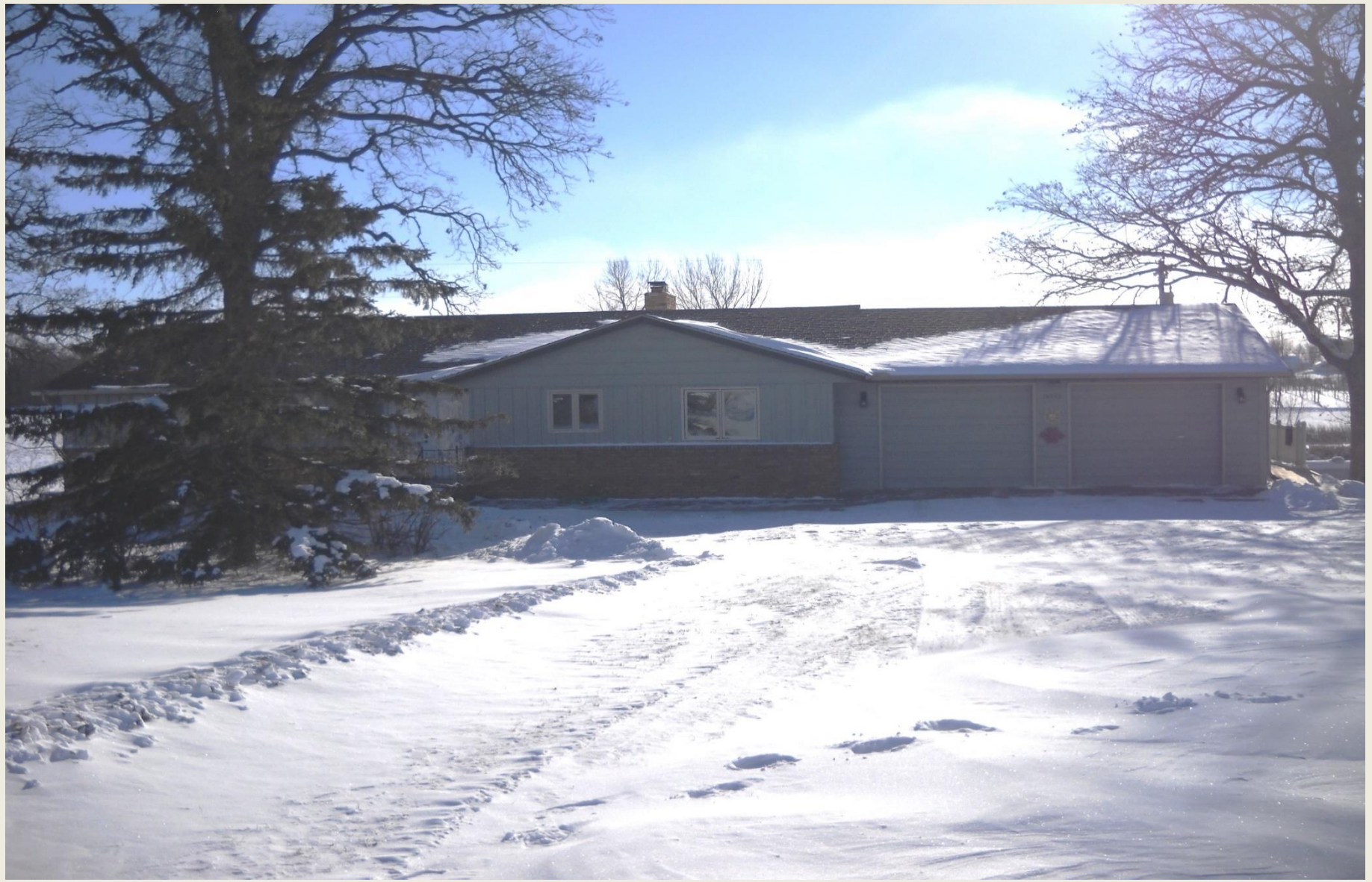
North Star Dharma Refuge