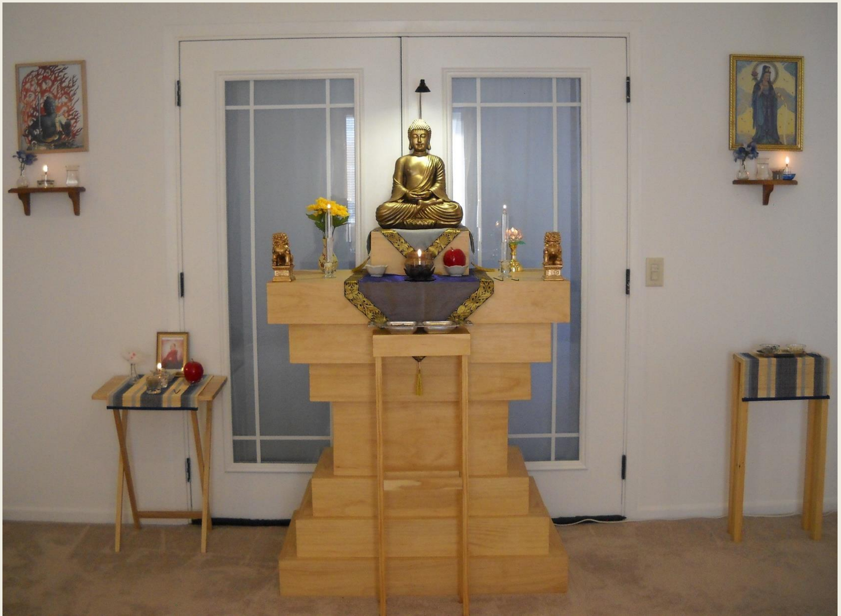
Altars in the meditation hall. (A description of the altars and their components can be found at http://northstardharma.org/orientation.htm )